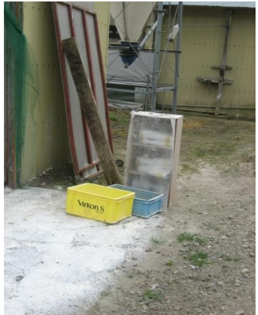
Location of clothing (white coats) and rubber boots for use in Hygiene Managed Areas/inside coops (Example)