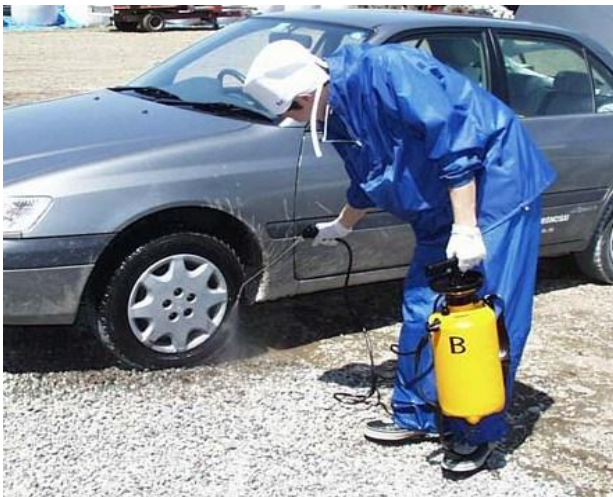
Clean Vehicles By Using Sterilization Pump