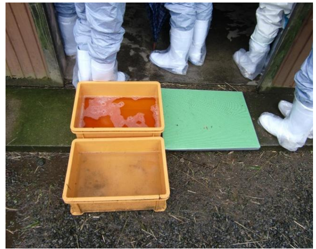
Footwear Sterilization Tub