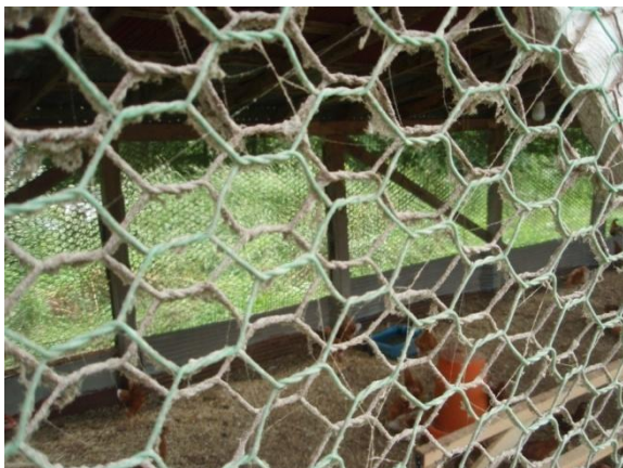
Example of doubled up 2cm (or larger) mesh

Please clean the feed bowl and the water-drinking equipment, such as the water cup. Confirm the state of the feed bowl each feeding and if you find the excrement of a wild animal, please clean it out.