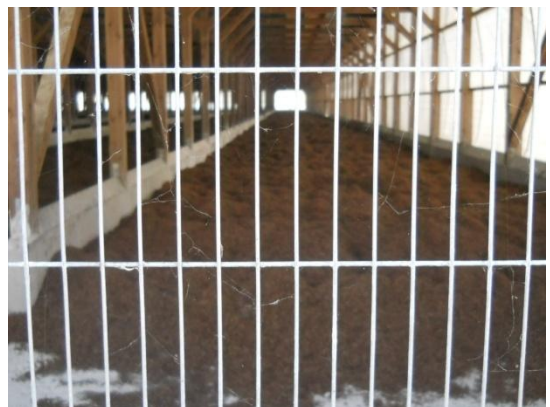
An example of using narrow wire mesh to prevent invasion by small birds