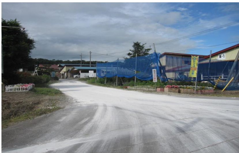
Farm Entrance Scattered With Slaked Lime