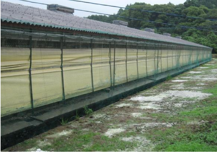
Bird nets surrounding the entire chicken coop.