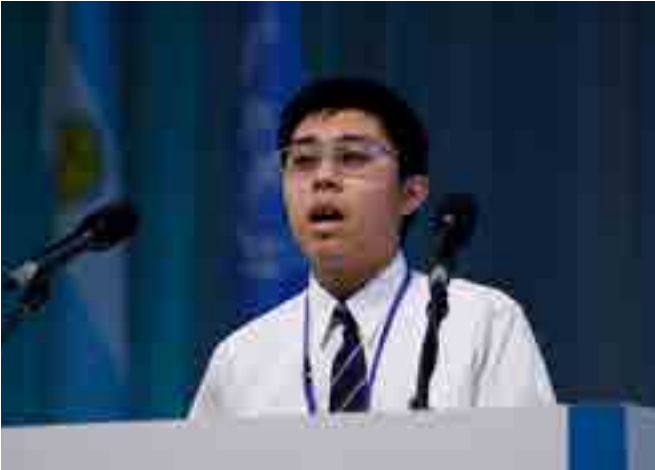
Hokkaido Sapporo Special Needs School for the Visually Impaired