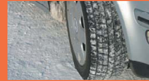
During the winter season, rental cars are always equipped with snow tires (for use on winter roads).

In Hokkaido, there are many winter activities, such as skiing, snowboarding and enjoying hot springs. Since the baggage required for these activities tends to be big, this is when rental cars can be very convenient. Winter roads, however, require advanced driving skills. Remember this basic knowledge to avoid serious trouble.