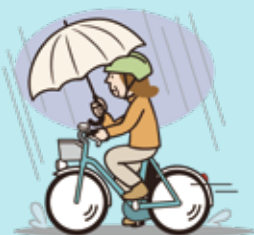
Riding while holding an umbrella

Penal Provisions A fine of not more than 50,000 yen