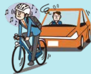
Riding while wearing earphones, etc.