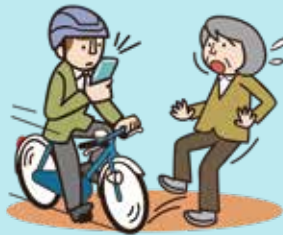
Riding while using smartphones, etc.